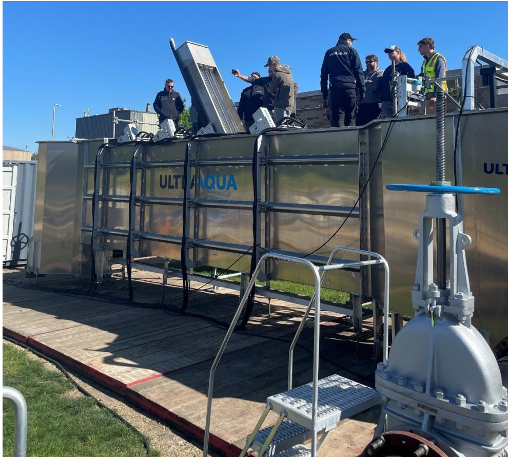
Photo A: UV Pilot representatives providing training to District Staff

The UV pilot system is fully operational, and staff are currently operating the system to test its effectiveness as a viable alternative to chemical disinfection. During the testing phase, the pumping equipment that supplies water for the pilot had a leak and resulted in a diesel spill at the site. The pump supplier, who was the responsible party, has completed all site remediation and cleanup in accordance with IEPA requirements.